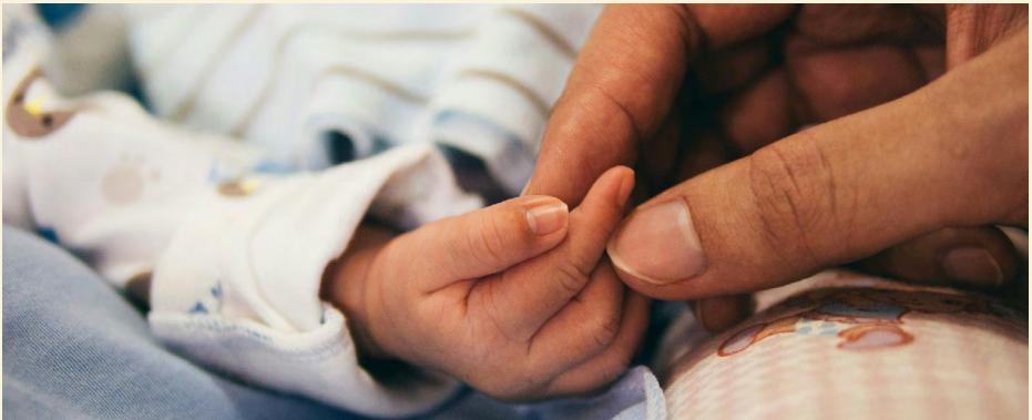
“Fearfully and wonderfully made” — Psalm 139 ·

“The heavens declare the glory of God, and the sky above proclaims his handiwork” (Psalm 19).